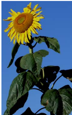
Sometimes technology blooms where you least expect it.