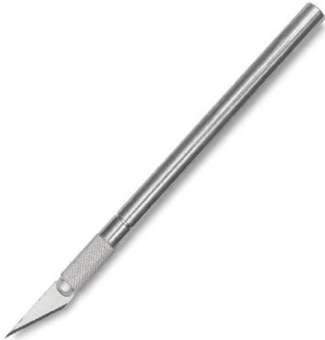
X-ACTO Knife #1